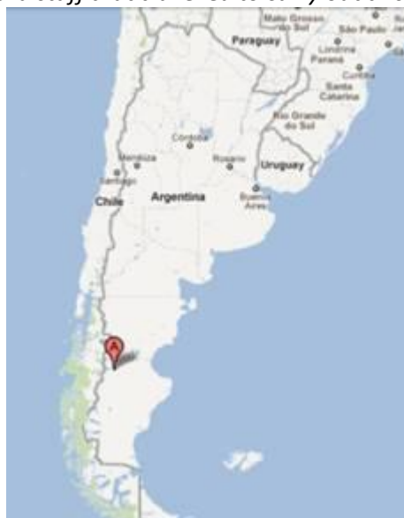
Map showing location of Perito Moreno Lab