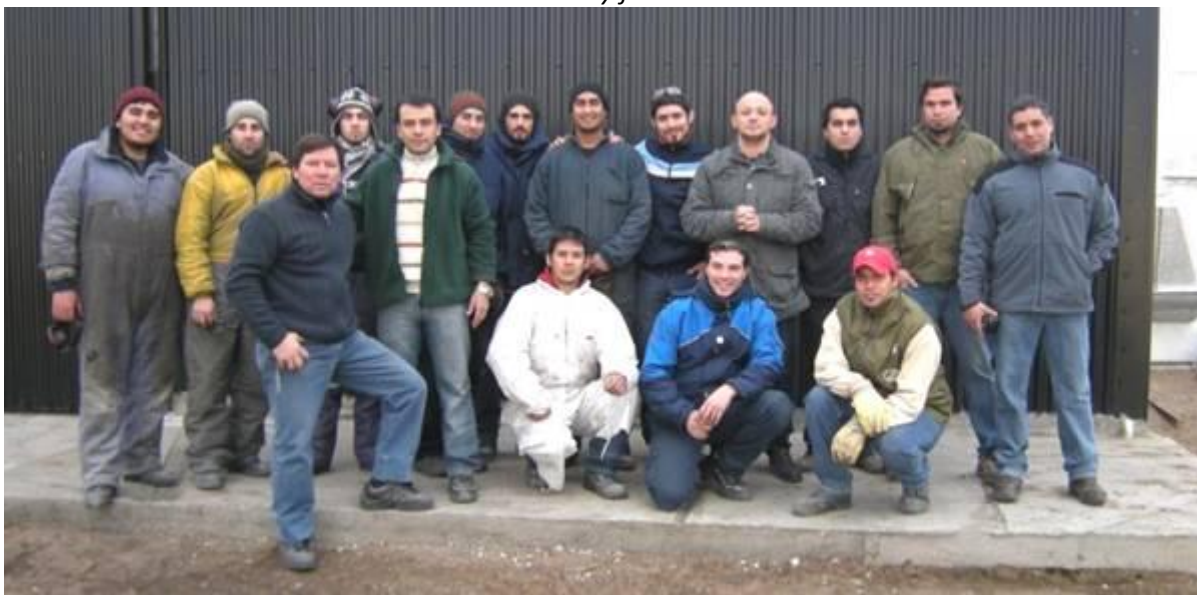
Part of the Mendoza staff that travelled to carry out this important project