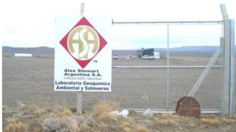
Site of laboratory pre-construction

We are very pleased to share our success and results of the hard work that was carried out by Alex Stewart Argentina.